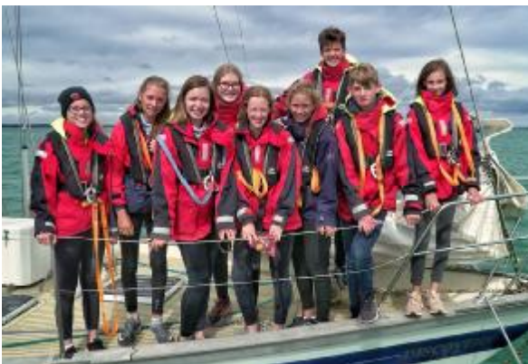
Alderbury ESU sailing the Solent